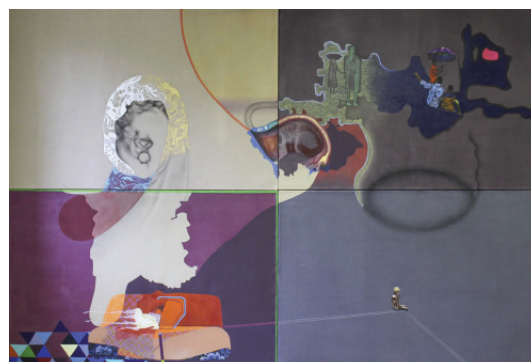
Lauréat Prix Révélation 2017 : Nina Tomàs, L'arrêt (polyptyque, technique mixte)